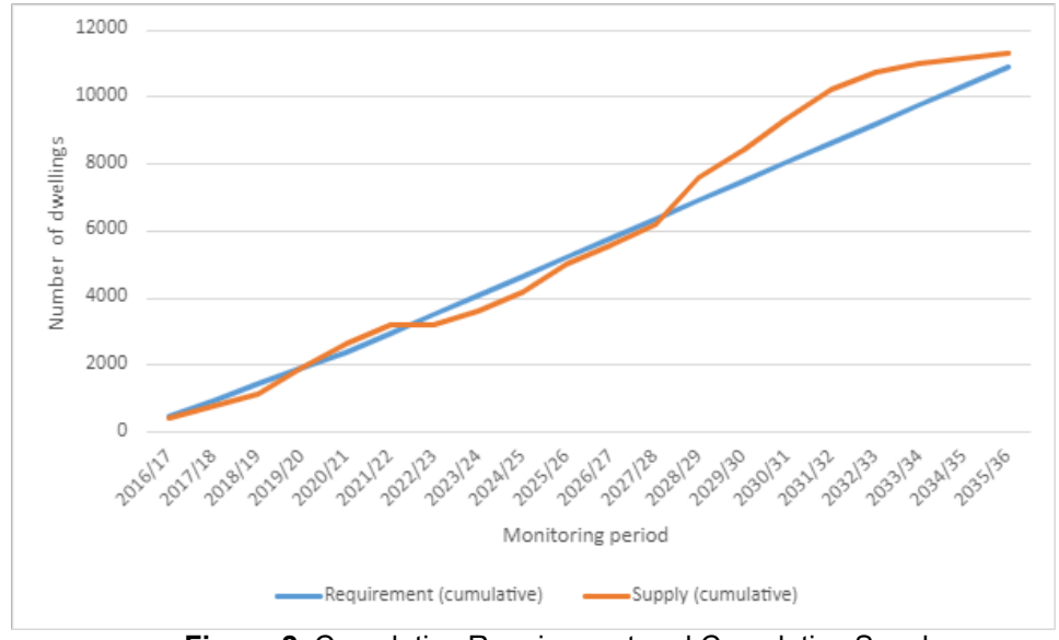
Figure 2: Cumulative Requirement and Cumulative Supply

12. Figure 2 below shows the cumulative requirement is ahead of the projection and is on target to meet the minimum of 10,884 dwellings to 2036 as set out in policy H1.